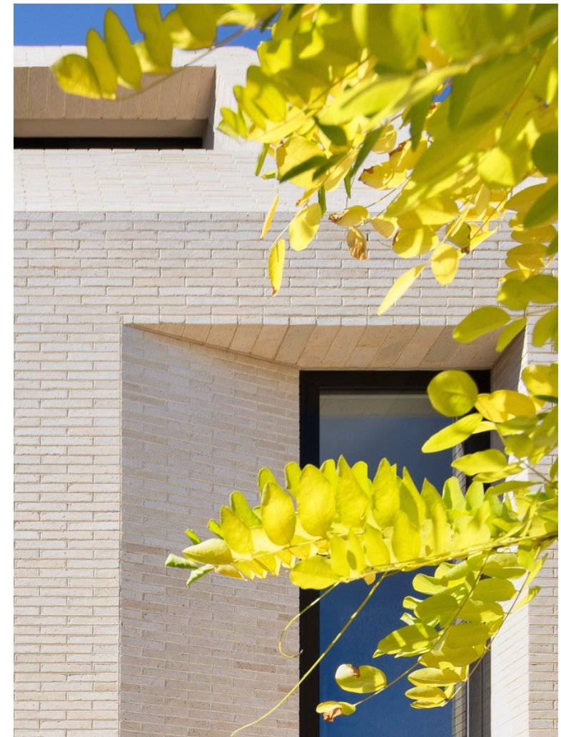
TATE Kew Project