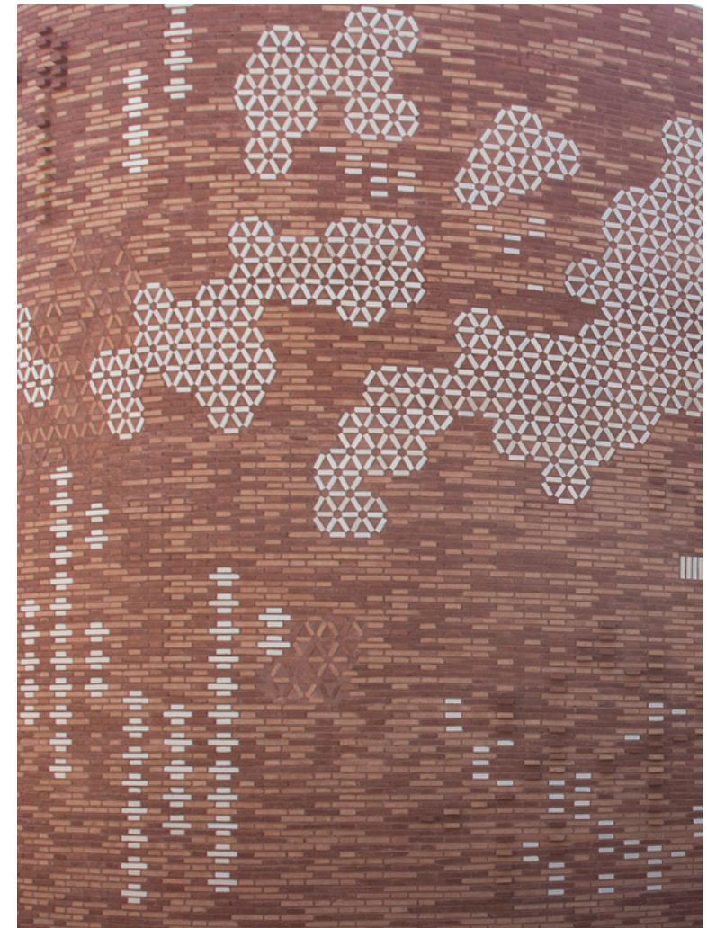
Kalida Sant Pau Centre