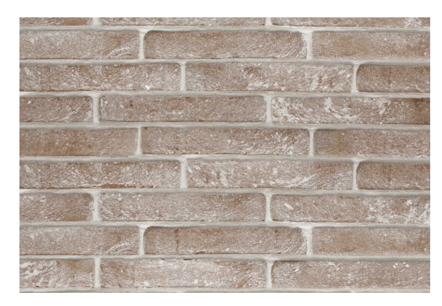
Tolus Sky Grey Eco-brick RF ± 238 x 75 x 40 mm