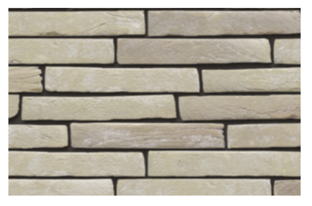
Tolus Jade Grey Eco-brick RF ± 238 x 75 x 40 mm