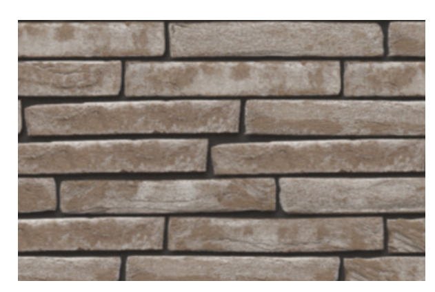
Tolus Tan Grey Eco-brick RF ± 238 x 75 x 40 mm