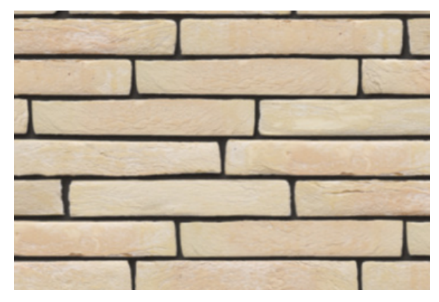
Tolus Mint Yellow Eco-brick RF ± 238 x 75 x 40 mm