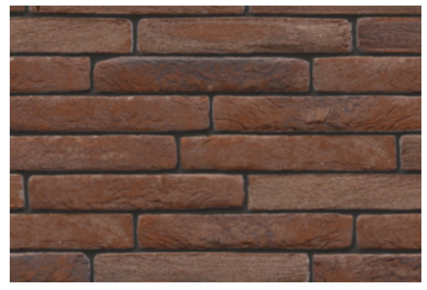
Tolus Maya Purple Eco-brick RF ± 238 x 75 x 40 mm