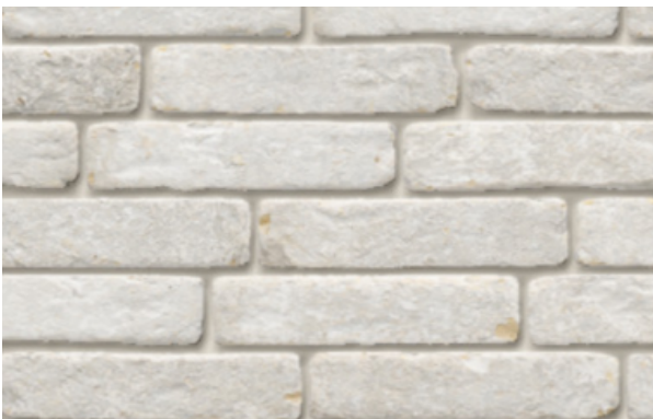
Nubilum Helios White * Eco-brick WF ± 215 x 65 x 50 mm Eco-brick WDF ± 215 x 65 x 65 mm