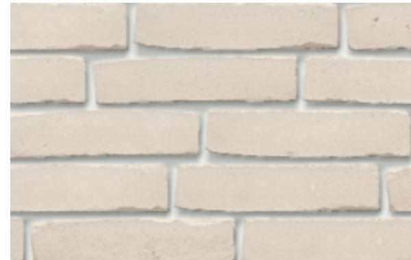
Amfora Duno Beige Eco-brick WF ± 210x65x50 mm