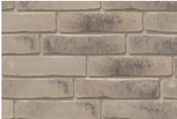
Amfora Rino Grey Eco-brick WF ± 210x65x50 mm