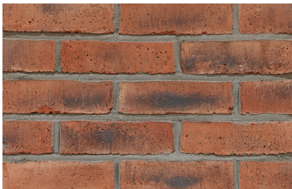
Amfora Westcliffe Weathered WF ± 215x102x65 mm