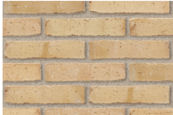
Amfora Zafferano WF ± 215x102x50 mm