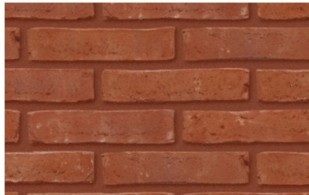
Amfora Rubino WF ± 215x102x50 mm