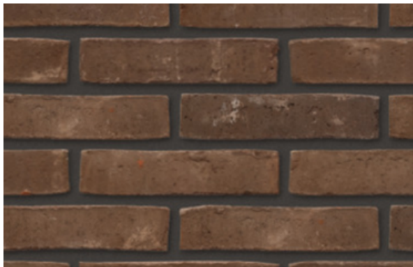
Amfora Castana WF ± 215x102x50 mm