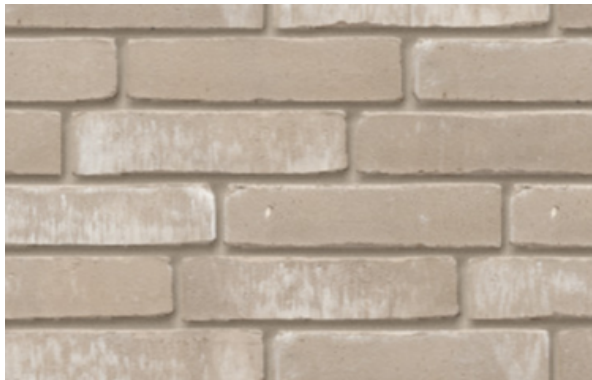
Amfora Misto Grey Eco-brick WF ± 210x65x50 mm WDF ± 215x65x65 mm