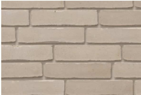
Amfora Silvo Grey Eco-brick WF ± 210x65x50 mm WDF ± 215x65x65 mm