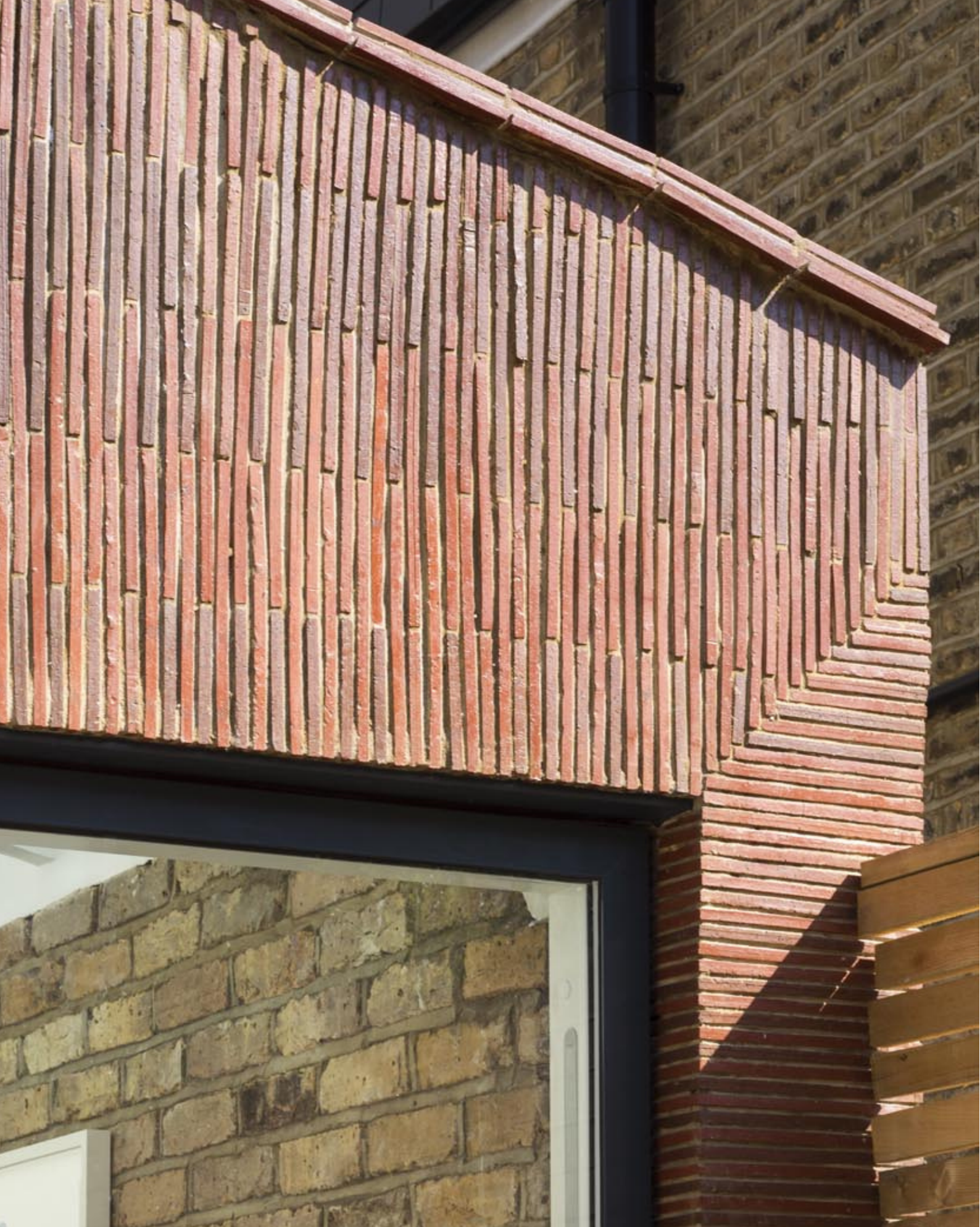
DECORATIVE STACKED CREASING TILES