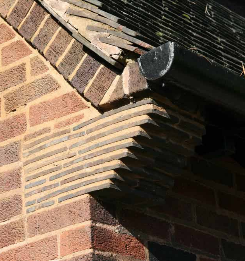
CREASING TILE CLADDING